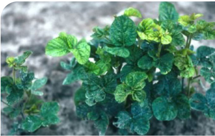
Soybean growth impacted by low soil pH (4.5).